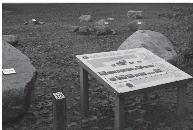
Fig. 5. Scandinavian boulders in the Petrographic Garden of the Wielkopolski National Park plays an educative, cognitive, aesthetic and geotouristic role