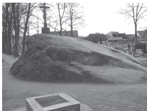
Fig. 3. St. Hedwig's boulder – the biggest erratic in situ in Wielkopolska region Phot. R. Zabielski, 2007.

Because the Polish regulations fail to provide such clear stipulations, glacial erratics here are increasingly subject to vandalism e.g. W. Chrzęszczewski 3 . The interesting structure and texture (size, shape) of the rock crystals, and often their color, frequently cause them to disappear from the landscape. They offer ideal stone-working material to sell to both individual customers (e.g. as gravestones, window sills, countertops, floors) and for large-scale investments (building façades, the interiors of major company headquarters or for instance Warsaw Metro stations). Their disappearance deals a blow to the given area's geodiversity, a gauge of the richness of its geological, geomorphological and geographic heritage. This, in turn, entails a drop in its attractiveness for geotourism, which obviously has an impact on the local policy of sustainable socioeconomic growth. Effective popularization of the geological heritage by local guides or interpreters of nature, in the form of workshops, eco-museums, geocaching/quests and the opening up of such sites to public access (provided that proper safety measures are taken) can definitely bring financial benefits directly to the local residents, and indirectly to the local governments of the areas where they are situated.