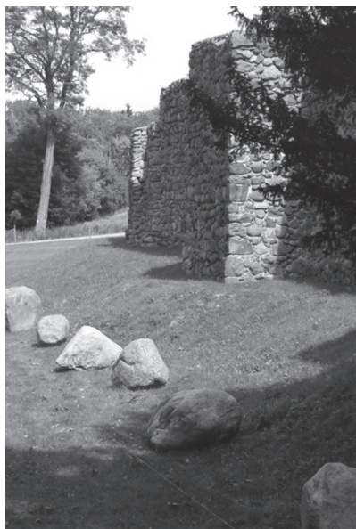
Fig. 4. Scandinavian boulders in the Petrographic Garden in Moryń (western Pomerania) is located in front of the medieval (15 th C) city wall, also built up from the erratics

Złocieniec (a branch department of the Regional Environmental Protection Directorate in Szczecin 5 ), the Lapidarium of the Institute of Geology, Adam Mickiewicz University in Poznań 6 ), the Petrographic Garden of the Wielkopolska National Park in Jezioro 7 (fig. 5); the “Drawnik” Petrographic Trail at Drawa National Park 8 and the Geological Garden on Dylewska Góra 9 . There are also some less formal ones, such as the rock collection nearby the school cluster in Kuźnica near Sokółka 10 , and the Geological Garden that forms part of the private Elżbietówka park near Brzeźno in the Wielkopolska region 11 .